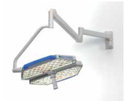
Wall-mounted version: ideal for special infrastructure conditions and procedures