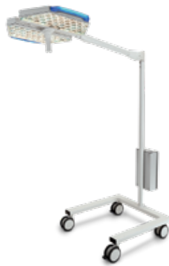
Mobile version: for emergencies or supplemental use