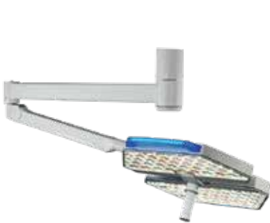
Low-ceiling version: complete mobility in rooms with height limitation

For optimal use in different clinical environments, the TL5000 Surgical Light is available in different versions and offers impressive versatility combined with investment protection.