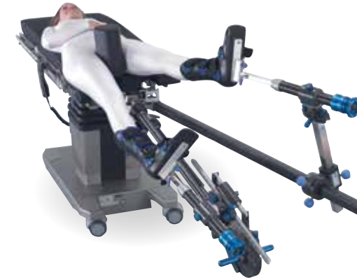
TRAUMATOLOGY AND ORTHOPEDICS Extension unit for hip replacement, arthroscopy and femur fractures.