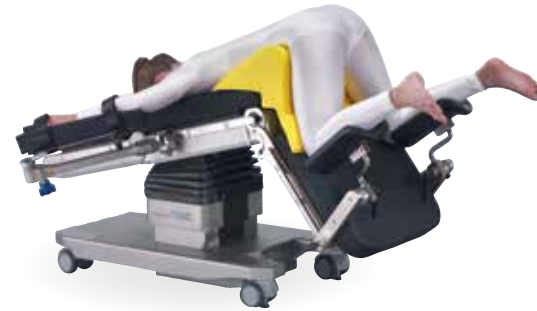
GENERAL SURGERY Jackknife position.