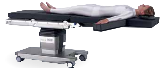
VASCULAR AND CARDIO SURGERY Special carbon fiber segments for cardiac and vascular surgery.