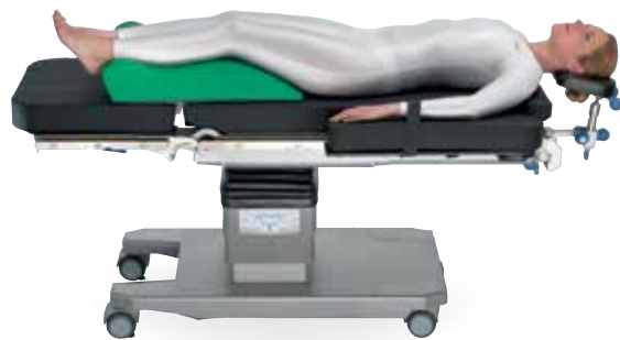
OPHTHALMOLOGY AND ENT Ophthalmology and ENT – head rest system.