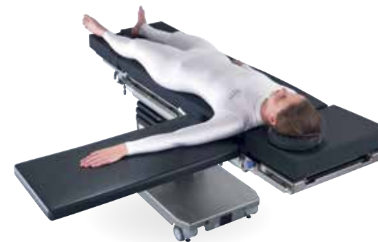
TRAUMATOLOGY AND ORTHOPEDICS Carbon fiber hand table for traumatological surgery to the upper extremity.