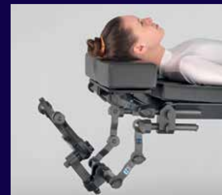
Patient initiation for neurosurgery.