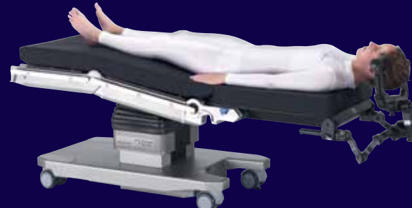
Extended carbon fiber component for greater imaging access.