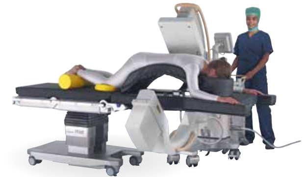
SPINAL SURGERY Spinal surgery with Wilson frame.