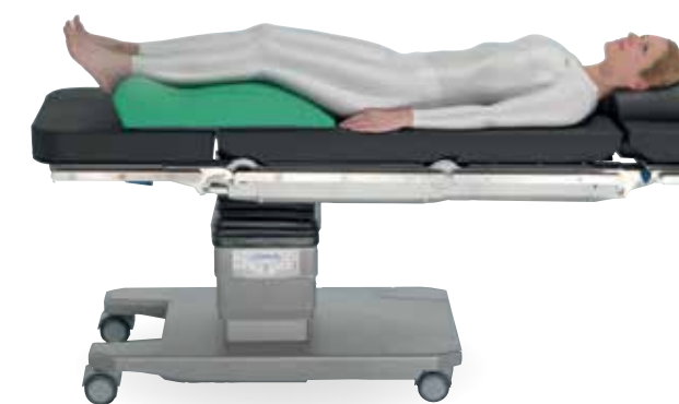
Lithotomy position for gynecology and urology.