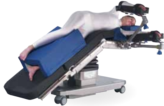
GENERAL SURGERY Lateral position for kidney surgery.