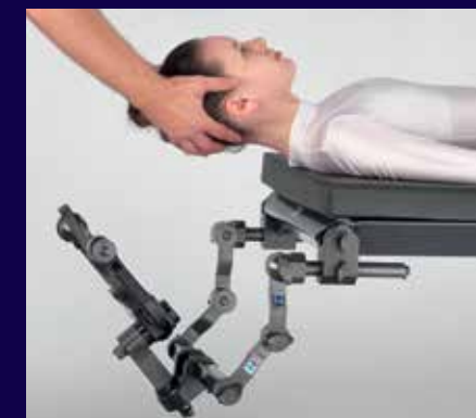
Properly position the patient for the procedure.