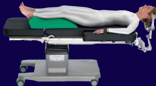
Craniotomy in the supine position.