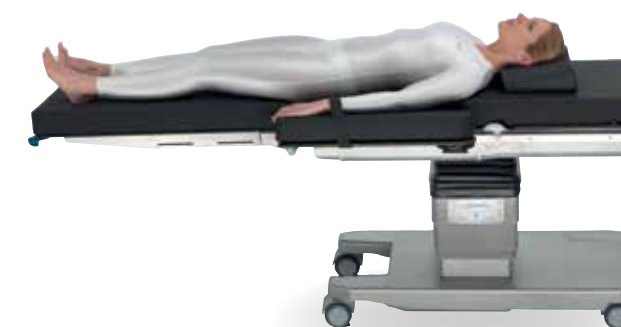
Efficient preoperative and postoperative positioning for lithotomy.