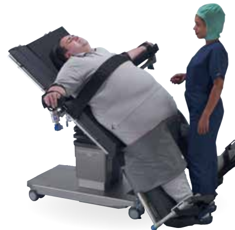
BARIATRIC SURGERY Sleeve gastrectomy.