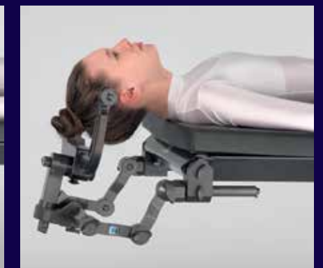
Skull clamp with 360° X-ray capability for neurosurgical applications.