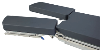
Two-Part Leg Section for midline access.

Hillrom offers an additional accessory package of specialty components that optimize patient positioning capabilities for complex robotic-assisted surgeries.